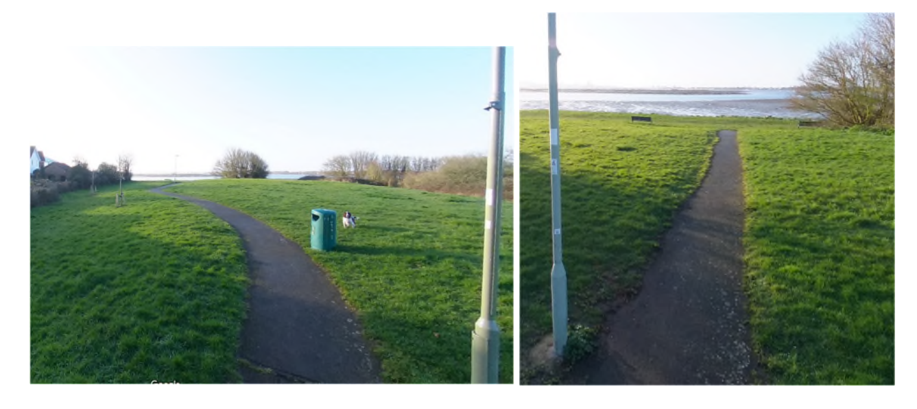
Fig. 5 – Just south of Point C, looking south