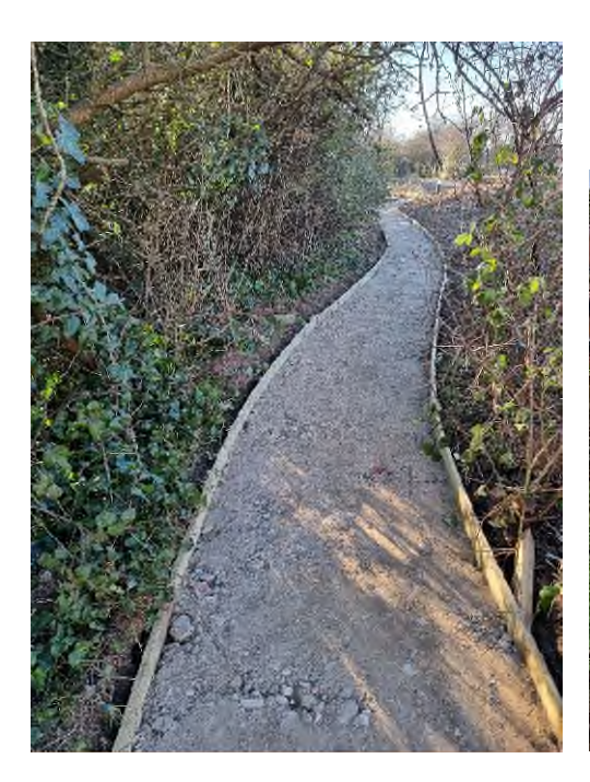
Fig 1. Between A-B, facing south