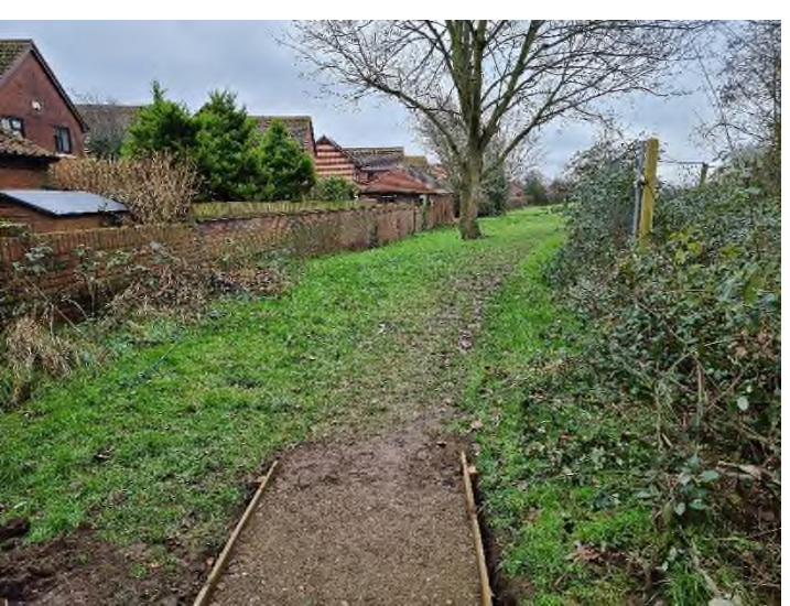
Fig 2. Between B-C, facing south

2.7 At Point C the path merges with a metalled, 1.8 metre-wide path that is currently maintained by FBC. The path commences at a junction with Audret Close (Point D) and runs between houses emerging into the public open space maintained by FBC. The path is lit, and a litter/dog waste bin is situated just south of Point C. Two benches are positioned either side of Point E, where the path meets the recently confirmed route of the King Charles III England Coast Path (see location map at Appendix 1). The images below show different sections of this route between D-E.