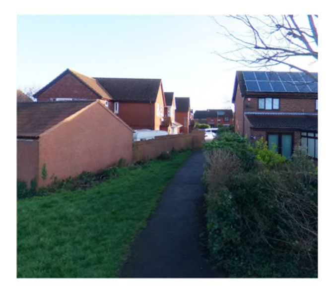
Fig. 4 – At Point C looking east to Audret Close